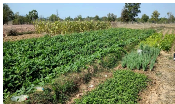
VEGETABLE SELLING IN CHAMPASACK PROVINCE

The project was implemented in 12 villages across six districts in three provinces, directly involving about 30 farm households. The project's objective is to educate and empower these farmers with the knowledge and tools necessary for sustainable farming practices.