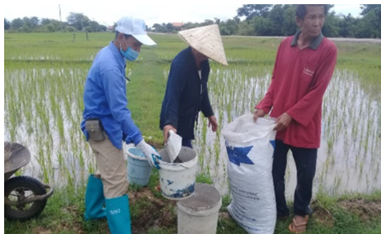
FERTILIZER APPLICATION IN OUTHUMPHONE DISTRICT

They learned to enhance their land's fertility and conserve water by using simple yet effective techniques, such as water retention systems, composting and diversified cropping.